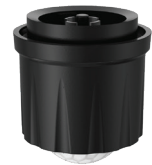
PIR motion sensor (for 0-10V) MAVCRH7C-PS