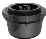
CASAMBI bluetooth wireless (for 0-10V) MACZ01-CA